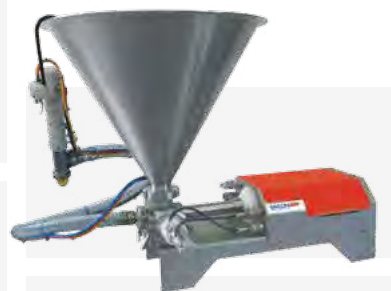
X Model with hose and gun