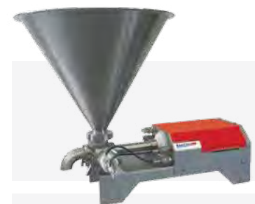
Z Model with dosing curve