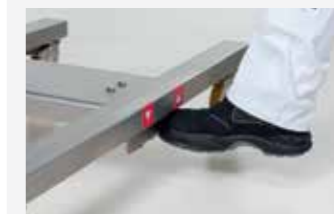
E Foot pedal