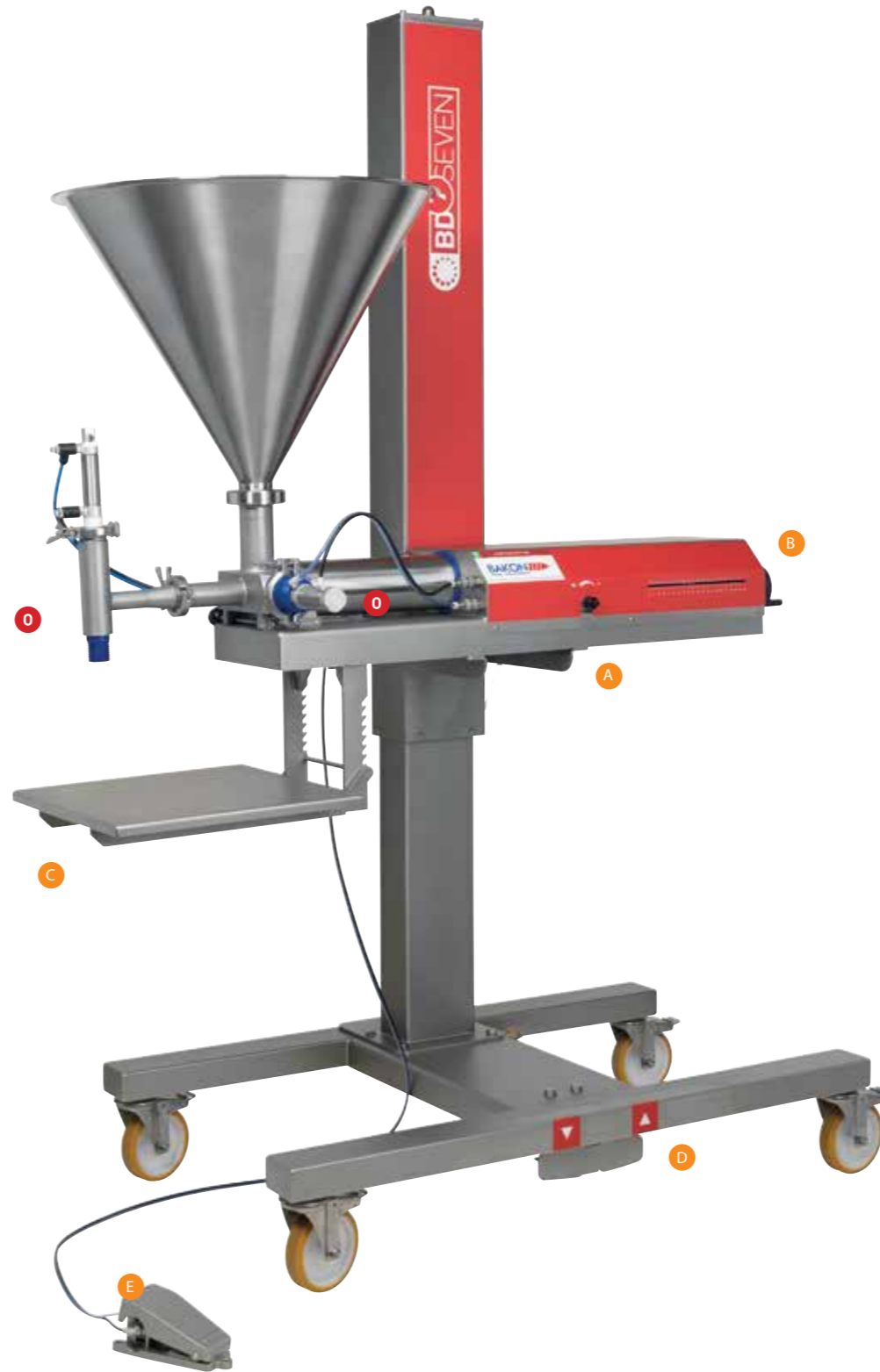
A Dosing volume The set volume is indicated on the scale