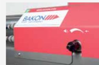
C The working table is manually adjustable (per 5 mm.)