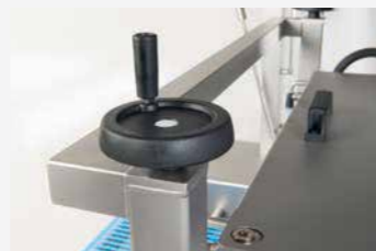
B Adjustable scrapers