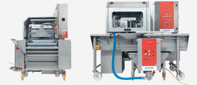
0 Melting kettle

The melting kettle can be placed next to the ENROBER for the automatic filling of the machine. This can be done in less than no time and while the machine is in use. A level control ensures that the container underneath the pouring machine keeps it level.