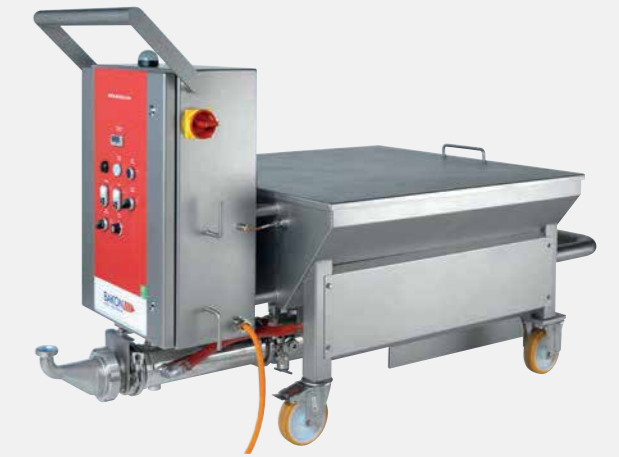
0 Movable and heated container.